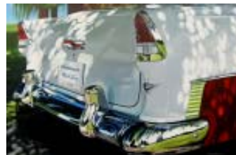
1955 Chevrolet Belair