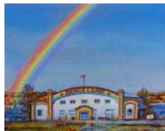
At the Foot of the Rainbow