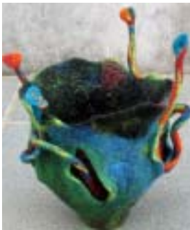
Over the Top