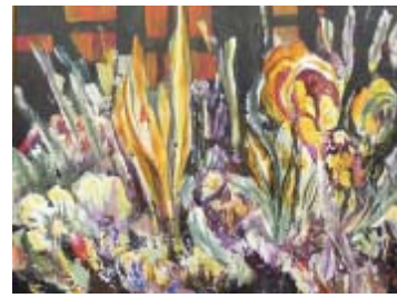
Flowers will Bloom in the Desert