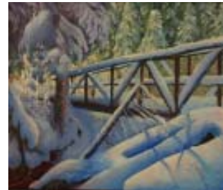
Bridge over Weskuso Falls