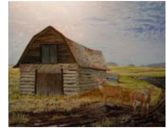
The Old Barn

★ Antonia (Toni) Ambrose a painter who works in acrylics and pastel mediums. She paints landscapes, florals and some portraits. View her work at the Studio - located in The Gallery on 3rd 102 3rd Av E in Watrous, use the backlane entrance Res. 306-946-3885 aaambrose@sasktel.net